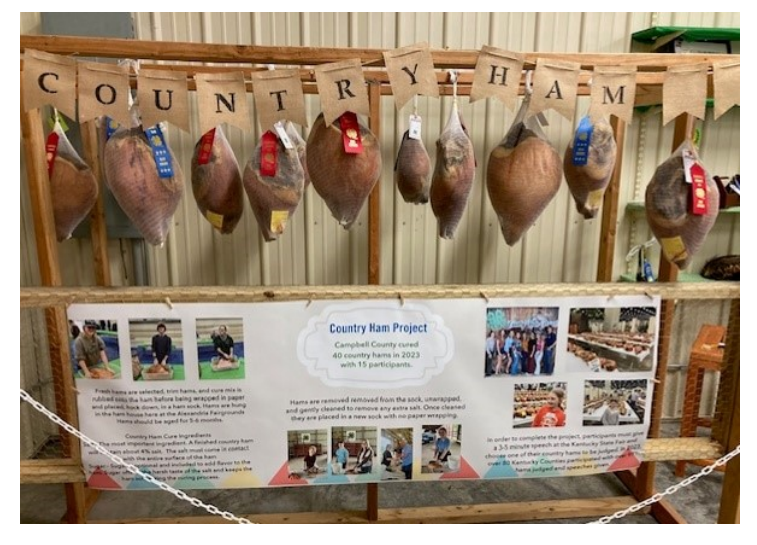
Page 2 — September / October 2023