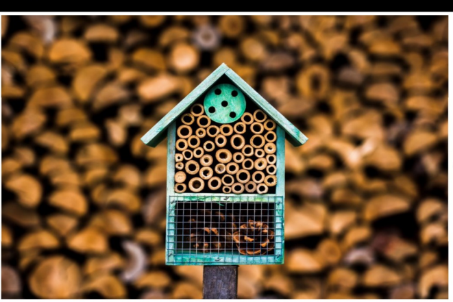
Educational programs of Kentucky Cooperative Extension serve all people regardles of economic or social status and will not discriminate on the basis of race, color, ethnic origin, national origin, creed, religion, political belief, sex, sexual orientation, gender identity, gender expression, pregnancy, marital status, genetic information, age, veteran status, or physical or mental disability. University of Kentucky, Kentucky State University, U.S. Department of Agriculture, and Kentucky Counties, Cooperating. LEXINGTON, KY 40546