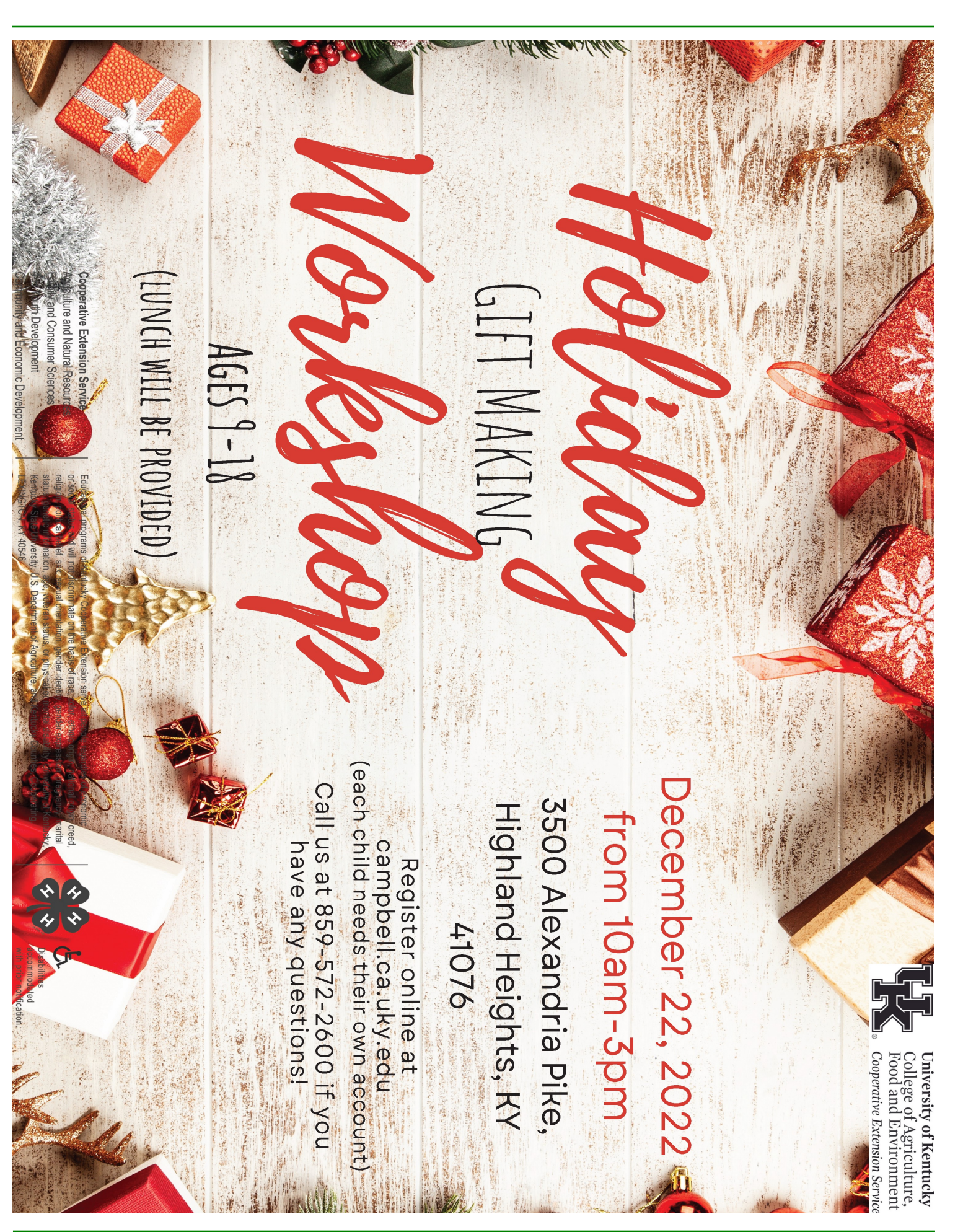
Page 16 — November / December 2022